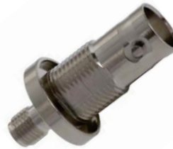
BNC to SMA bulkhead adapter