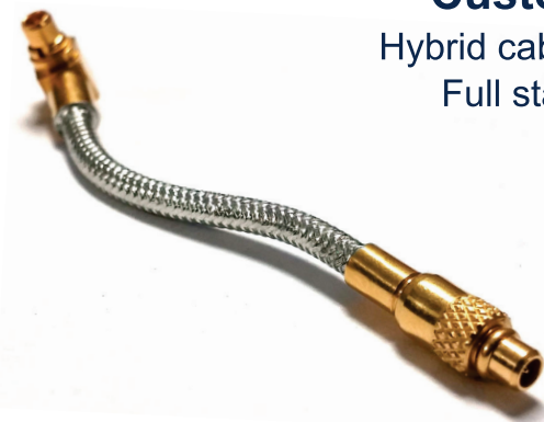
MCX to R/A MCX hand conformable cable

Hybrid cables/connectors Full staff of engineers Harnessing Gangmate Adapters