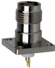
Flange mount TNC