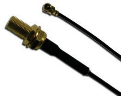
AMC to bulkhead SMA cable