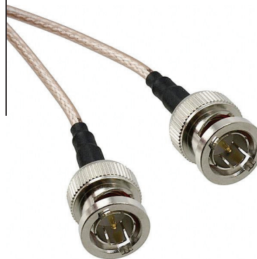
BNC to BNC cable