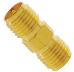
SMA to RP SMA adapter